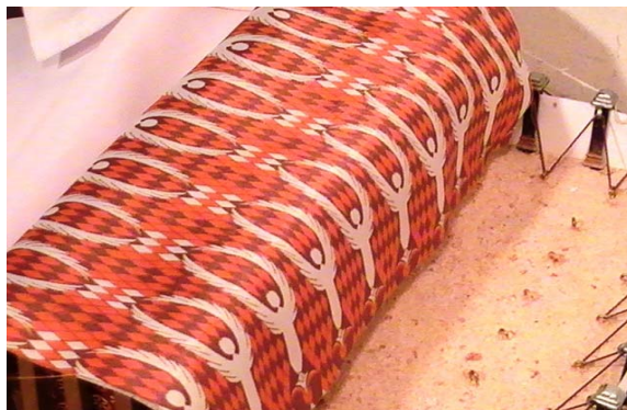
PICTURE OF THE HIDDEN LINEN COVERING OVER THE TABERNACLE.

The photo on the linen covering is obviously not a perfect example, but it gives us some light on the linen cloth engraved with Cherubim